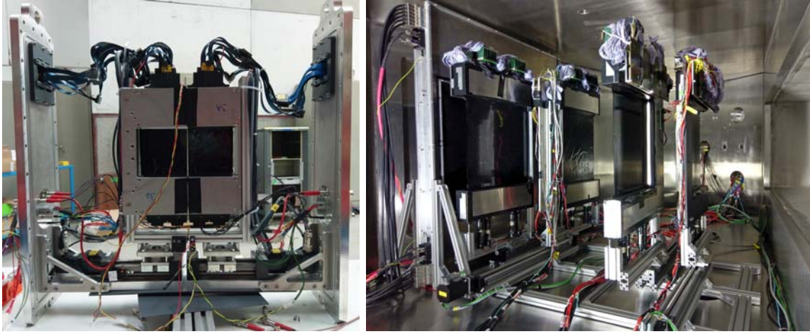
Figure 2. Scintillation fiber detectors to track the reaction products. Left: Two fiber detectors with 200 \mu\text{m} square fibers and an active area of 10x10 \text{cm}^2 . Right: Four fiber detectors with 500 \mu\text{m} square fibers and an active area of 50x50 \text{cm}^2 in the vacuum chamber connected to GLAD. All fiber detectors are mounted on linear drives to adjust the slits inbetween.