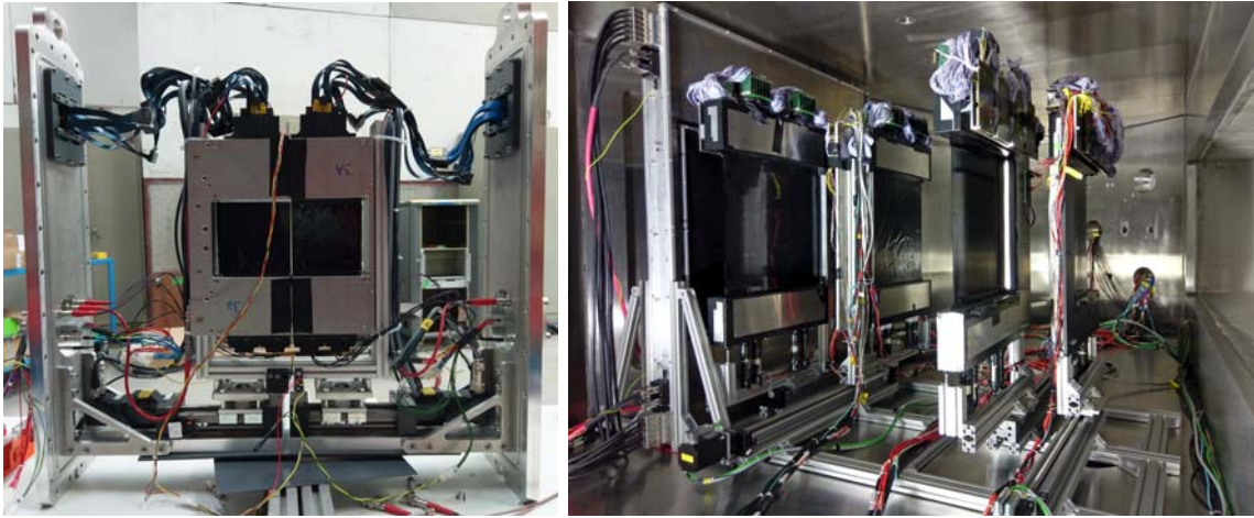
Figure 2. Scintillation fiber detectors to track the reaction products. Left: Two fiber detectors with 200 \mu\text{m} square fibers and an active area of 10 \times 10 \text{ cm}^2 . Right: Four fiber detectors with 500 \mu\text{m} square fibers and an active area of 50 \times 50 \text{ cm}^2 in the vacuum chamber connected to GLAD. All fiber detectors are mounted on linear drives to adjust the slits inbetween.