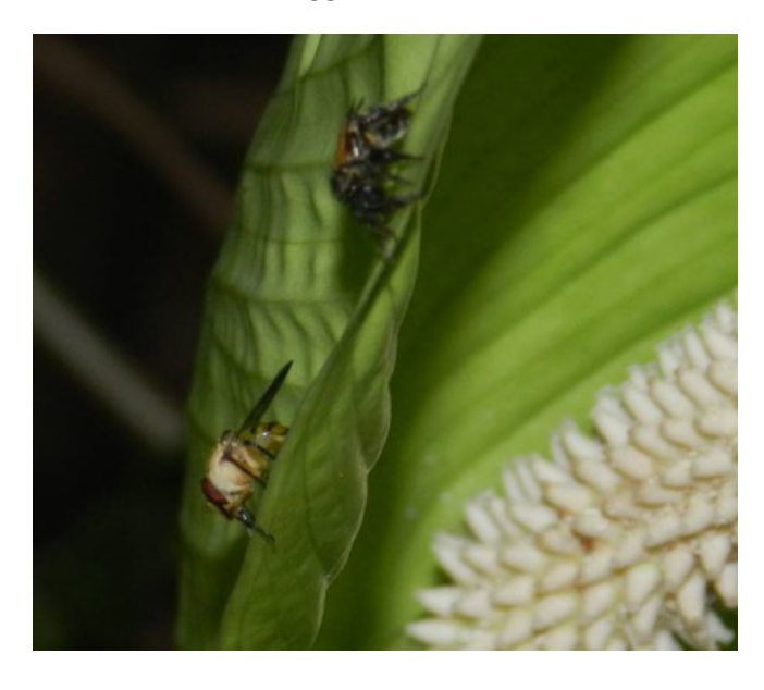
Figure 2. Wasp (top) and fly (bottom) on spathe of Spathiphyllum grandifolium ENGL.