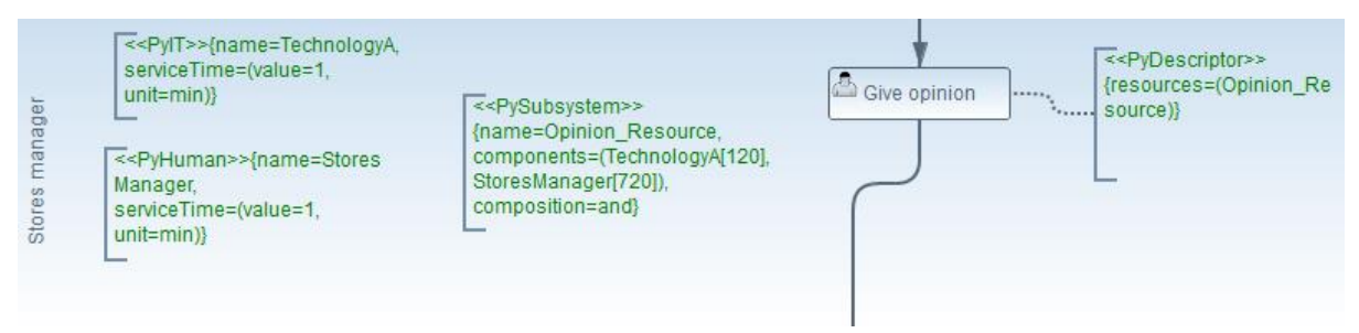
Figure 2: Resources definition and annotated task

In addition, to add the non-functional specifications, he uses text annotation following PyBPMN syntax in the same model. Therefore, he links to each resource's type its non-functional properties. Then he assigns to each task its resources (Figure 2). (In this use case we will only provide the results of the service time).