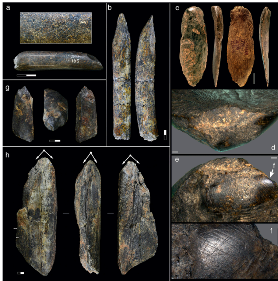
Figure 1. Pseudo and potential bone tools. (a) Size 2 bovid radius from JK (163) that has been cut marked. Mary Leakey may have identified this as a tool owing to the cortical flake that was removed from the end of the specimen. We interpret this as resulting from marrow extraction with a hammerstone-on-anvil technique. (b) Hippopotamid canine from HEB West (1518) interpreted by Leakey as a tool, but as natural modified here. (c) Proboscidean incisor fragment from JK (276) that exhibits polish and a point-like shape (scale = 1 cm). (d) Superior view of the proximal portion of the JK 276 fragment (scale = 1 mm). (e) Superior view of the proximal portion of the JK 276 fragment (scale = 1 mm). (f) Close-up of polish on JK 276 fragment (scale = 1 mm). (g) Size 4 limb bone fragment from WK East A (2749). One end has flake scars that suggest the possibility of intentional shaping. (h) Proboscidean limb bone shaft fragment from WK (526) that exhibits multiple flake scars indicative of marrow extraction using a hammerstone-on-anvil technique (arrows indicate the direction of impact). Black and white scales = 2 cm. JK = Juma's Korongo; WK = Wayland's Korongo.