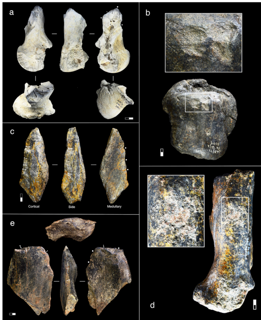
Figure 2. Confirmed bone tools. (a) Size 5 mammal humerus from HWK EE (386a) that has been tooth marked by carnivores and intentionally shaped proximally. Arrows indicate the direction of impact, whereas circles identify scars on the opposing surface. (b) Proboscidean astragalus from JK (3109) that has been used as an anvil likely for bipolar percussion. (c) Proboscidean limb bone from HEB (326) that exhibits evidence of intentional shaping. Arrows indicate the direction of impact, whereas circles identify scars on the opposing surface. (d) Hippopotamid humerus from PDK (895) that has been battered through use as an anvil or through use as a soft hammer implement. Distal epiphysis has been gnawed by carnivores. (e) Proboscidean limb bone shaft fragment from WK (4601) that has been intentionally shaped through knapping. Arrows indicate the direction of flaking, whereas circles identify scars on the opposing surface. Black and white scales = 2 cm. JK = Juma's Korongo; WK = Wayland's Korongo; PDK = Peter Davies Korongo.