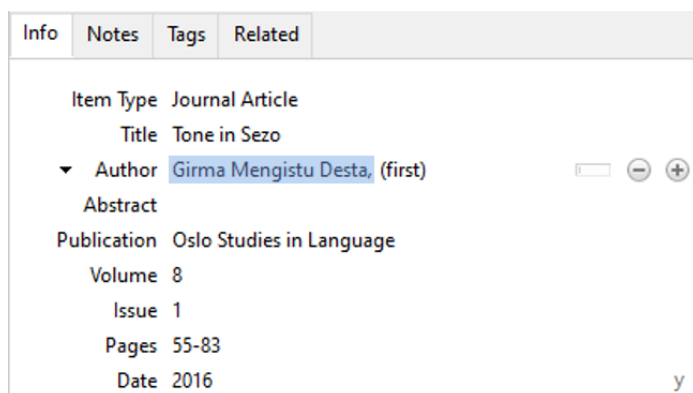
Figure 1. Zotero metadata sheet

In order to sort Ethiopian authors by their GIVEN NAME according to R2, all name components (GIVEN NAME, FATHER’S and GRANDFATHER’S NAME) need to be inserted into the field “last name”; the field “first name” remains empty (Figure 1). 5