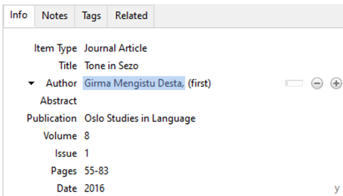
Figure 1. Zotero metadata sheet

In order to sort Ethiopian authors by their GIVEN NAME according to R2, all name components (GIVEN NAME, FATHER’S and GRANDFATHER’S NAME) need to be inserted into the field “last name”; the field “first name” remains empty (Figure 1). 5