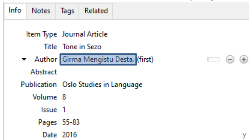
Figure 1. Zotero metadata sheet

In order to sort Ethiopian authors by their GIVEN NAME according to R2, all name components (GIVEN NAME, FATHER’S and GRANDFATHER’S NAME) need to be inserted into the field “last name”; the field “first name” remains empty (Figure 1). 5