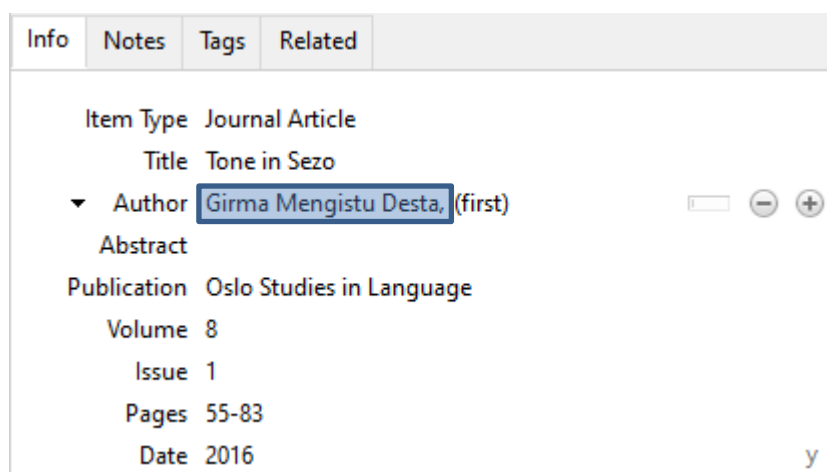
Figure 1. Zotero metadata sheet.

In order to sort Ethiopian authors by their GIVEN NAME according to R2, all name components (GIVEN NAME, FATHER’S and GRANDFATHER’S NAME) need to be inserted into the field “last name”; the field “first name” remains empty (Figure 1). 7