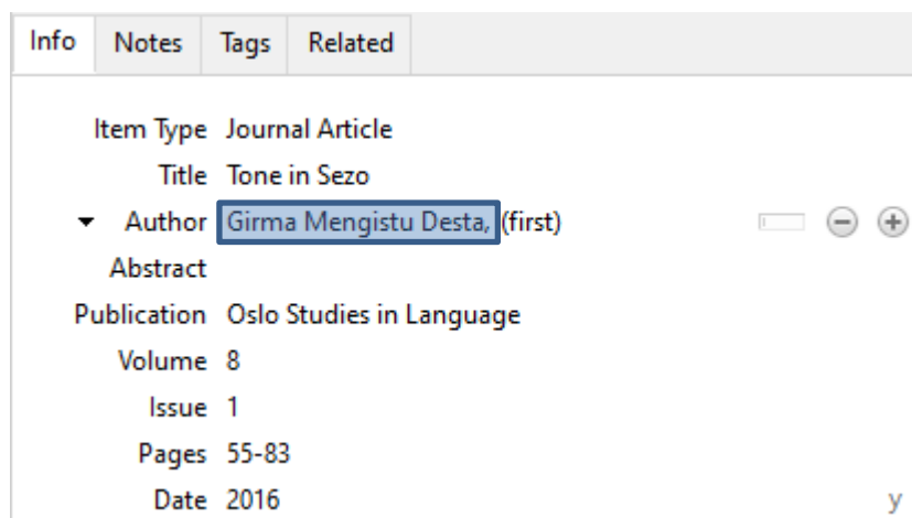
Figure 1. Zotero metadata sheet.

In order to sort Ethiopian authors by their GIVEN NAME according to R2, all name components (GIVEN NAME, FATHER’S and GRANDFATHER’S NAME) need to be inserted into the field “last name”; the field “first name” remains empty (Figure 1). 7