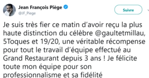
Figure 2: promotion by Jean-François Piège.

We find three classes, or lexical worlds, in this corpus. A large part of the corpus, represented by the first class with almost 60% of the terms, is related to promotion, and another part, represented by the third class and by 24% of the terms, is also linked to promotion, but in English. An example of tweets of this type is given in Figure 2.