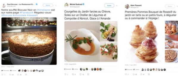
Figure 5 : Tweets linked to culinary techniques

We note that with the verbs, can be extracted culinary techniques ( stuff, blow, brew ) but also ways of living the dining experience ( discover, taste ) which confirms our idea that these data have a heritage interest. For example, the tweets in Figure 5 present dishes using techniques and products that fit into the heritage process presented.