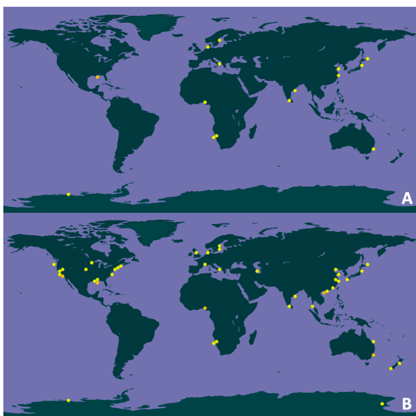
Figure 2. (A) Location of the 25 georeferenced records (among the total 35 occurrences) for the genus Dissulfurirhabdus in June 2020 based on the metagenomic 16S ribosomal RNA gene sequences from the GBIF database; (B) Location of the 114 georeferenced records (among the total 200 occurrences) for the genus Dissulfurirhabdus in June 2020 based on the metagenomic and metabarcoding 16S rRNA sequences from the GBIF database.

The survey also revealed that the habitats of D. thermomarina are not limited to shallow sea hydrothermal vents, but also include marine coastal sediments, marine benthic sediments, ocean water column, pond soils, salt marshes or lagoon sediments contaminated with PAHs ( https://www.gbif.org/species/9334679 ) (Figure 2A). In addition, 200 occurrences of the genus Dissulfurirhabdus of which 114 georeferenced were found primarily in different parts of the world ocean ( https://www.gbif.org/species/9334679 ) (Figure 2B). Since no studied thermophilic sulfur disproportionators are known to form endospores or dormant cells, we can assume that they are in active metabolic state.