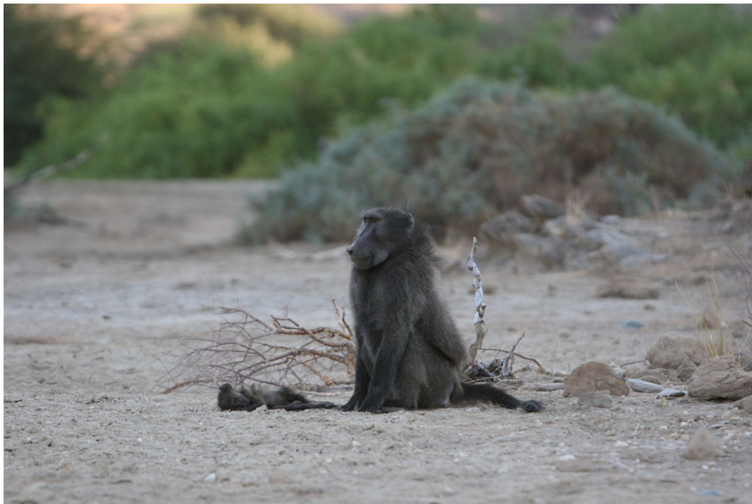
Figure 1. Case 7: CHO sits beside BRA's infant's corpse. Adult male CHO sits near the corpse of BRA's infant as she forages nearby.

CHO charged the observers several times. BRA carried the corpse for 2 days before an observer retrieved it to perform the necropsy and take a tissue sample for biopsy. At this stage, BRA was regularly foraging away from the corpse and was less vigilant towards it.