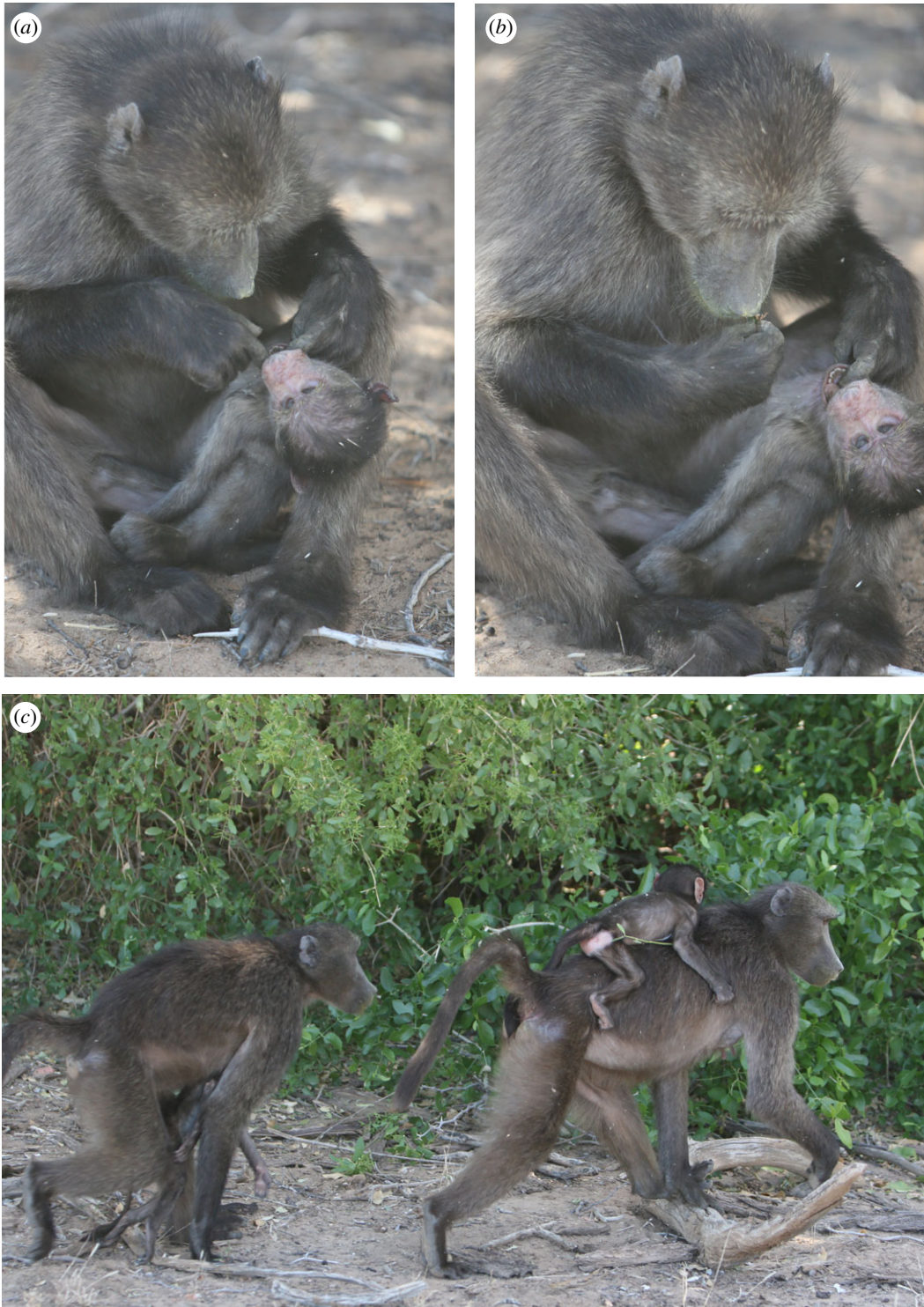
Figure 4. Case 12, ANA's responses to BIL's dead infant. (a) ANA cleans inside and (b) removes debris from the mouth of the corpse. (c) ANA approaches BUB, BIL's adult daughter, who had a similar-aged son at the time of BIL's infant's death.

macaque mother ( Macaca tonkeana ) [35] and a juvenile female bonnet monkey ( Macaca radiata ), unrelated to the dead infant whose mouth she investigated [11]. Similar observations have given rise to discussions about compassion towards the dead individual, as was the case for cleaning the teeth of an adolescent male chimpanzee's corpse [7]. Evidence for compassion has also been hypothesized in an adult male Sichuan snub-nosed monkey's ( Rhinopithecus roxellana ) behaviour towards a recently deceased individual, which was described as 'exploration, attempts to elicit a response from the (deceased individual), and affiliative acts including embracing' [36, p. R404].