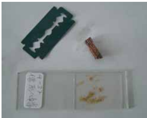
Figure 2. Wood sample and microscopic slide.