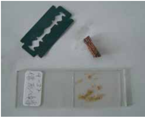
Figure 2. Wood sample and microscopic slide.