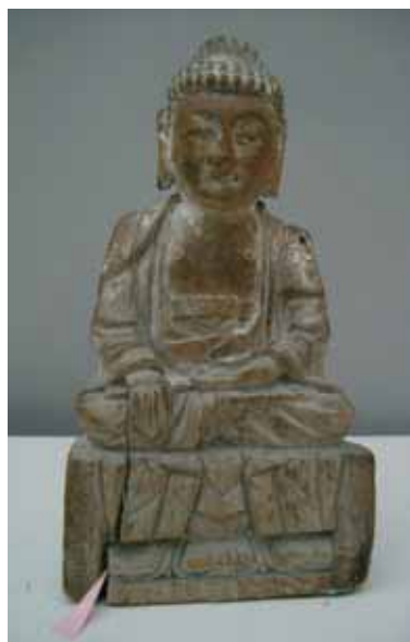
Figure 1. Sampling in a crack (see arrow) of a seated Buddha Shakyamuni, h. 30.5 cm. Völkerkundemuseum, Munich.

Small samples are taken from the sculptures by means of a scalpel. They are removed so as not to harm the integrity of the sculpture—from hollowed-out parts, from the bottom of the sculpture, from cracks, or from damaged areas (fig. 1). The exact location from which the sample is taken is recorded. Most of the sculptures are made by assemblage of several pieces; some of these have been added during restoration. For this reason it is preferable that samples be taken from different parts of the sculpture.