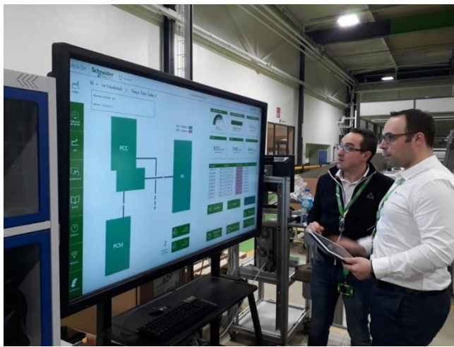
Fig. 3. Schneider Factory of the Future, Vaudreuil

Industry 4.0 implemented the principle of collaboration human-machine in co-bots [26] and some factories of the future, such as those of Schneider Electric in Vaudreuil. AI powers the cyber physical systems and digital twins [27].