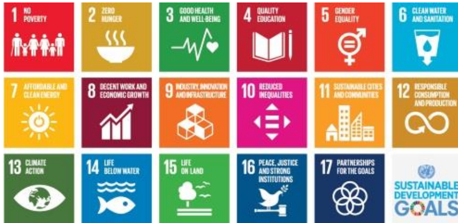
Fig. 4. Sustainable Development Goals, source un.org

According to Anthony Wang [30] it is over 70 various principles for AI ethics. One of the most repeated is that AI has to be beneficial for humanity. I add “and planet”.