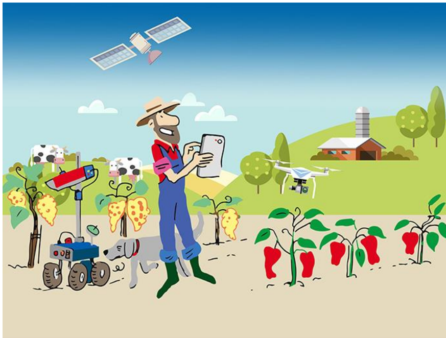
Fig. 5. Connected Farmer, source [35]

We can imagine another approach combining the knowledge about soil and environment with knowledge about crop rotation, association of vegetable/fruits to avoid pests attack, chose the right period for sow and plant in function of available seeds. Such farmer advisor programmed applying green software principle can be powered with solar energy.