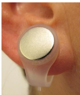
Figure 2: The Scar Wars clip

It was then the time to think about testing it on targetted concerned patients with keloid scars.