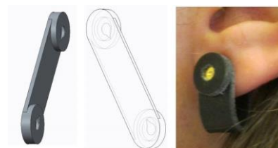
Figure 1: digital and first physical version of the clip

It permitted to define then the size, but also to determine the fact that our idea would need to be constituted of a clip on which magnets could be easily inserted. We had our proof of concept definition prototype.