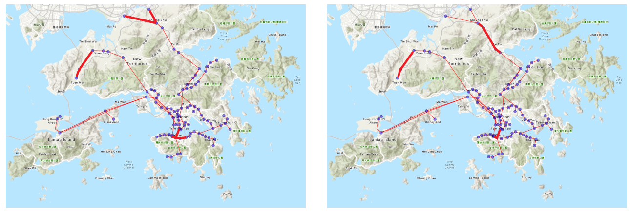
Workdays on and before Jan 24