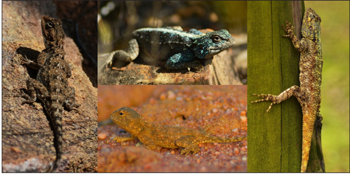
FIGURE 1. Four agamid species from southern Africa. (A) Agama aculeata distanti (Eastern Ground Agama), (B) A. atra (Southern Rock Agama), (C) A. armata (Peter's Ground Agama), and (D) Acanthocercus atricollis (Southern Tree Agama).