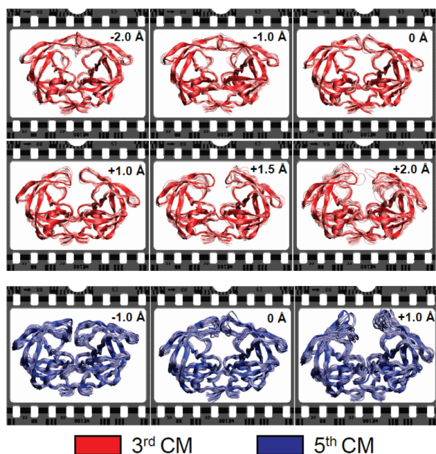
Figure 1. Snapshots of HIV-1 protease taken from MD simulations with umbrella sampling along the consensus mode directions describing flap opening. Each frame contains 20 superposed snapshots sampled at 5 ps intervals from an independent MD trajectory restrained to a particular normal mode value: from -2 to +2 Å for the mode 3 and from -1 to +1 Å for mode 5.

Nevertheless, the amplitude of the conformational dynamics seen in unbiased MD simulations only accounts for a small part of the conformational variability observed experimentally, due to the long time scales characterizing the motion, which have been estimated to be on the order of several hundred nanoseconds or microseconds. 28,29 Further, enhanced sampling methods do not always increase exploration of flap opening movements. In a recent study of the binding of a peptide substrate to PR, seven different collective coordinates were biased simultaneously using explicit solvent simulations over 1.6 \mu\text{s} . 30 Only semiopen structures were observed; full flap opening that would be necessary to allow the entrance of the natural polyprotein substrate was not observed.