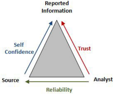
Fig. 1. Model for trust analysis.

trust is to be constructed from various dimensions. The model consists of several elements related by functions, see fig. 1.