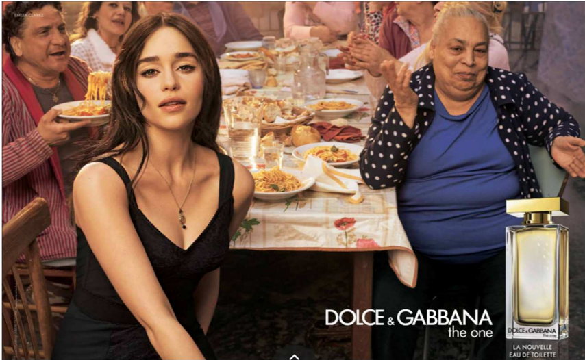
Marie Claire France #785-2017