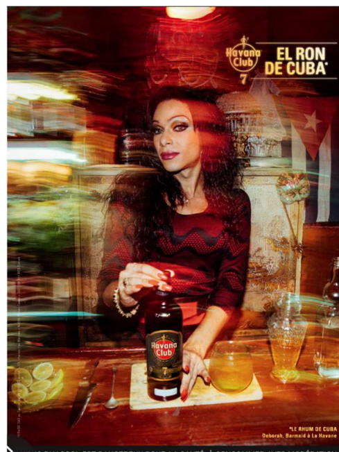
GQ France #116-2018