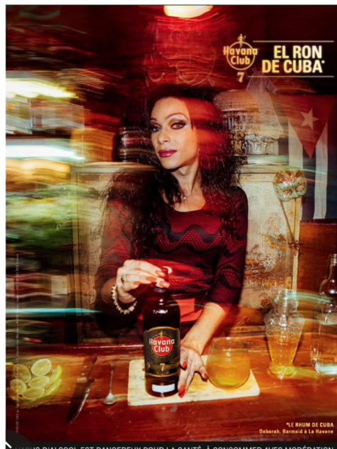
GQ France #116-2018