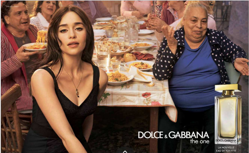
Marie Claire France #785-2017