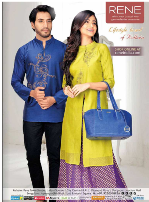
Cosmopolitan India #10-2017