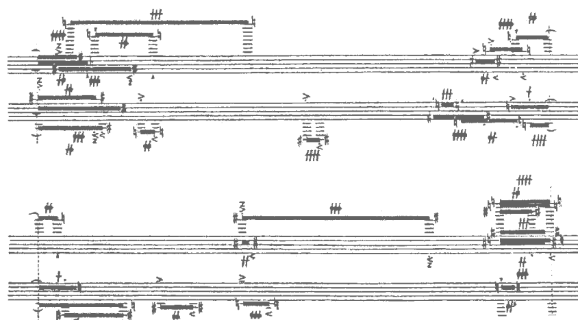
Fig. 1: An excerpt of the score: page 1, 3 d & 4 th systems. © 1975 Universal Edition (Canada) Ltd, Toronto.

The musical notation is a blend of traditional elements — the two staves of the piano system, the horizontal reading from left to right, the proportional time representation — with less usual graphic symbols for pitches, durations and articulation. These symbols are very carefully explained in the composer’s foreword, and the graduation of intensities and articulations is extremely subtle.