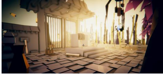
Fig. 1. E-LearningScape screenshot

This serious game is an interesting case study for our research question, which is: Does ECS architecture help to add unanticipated accessibility functionalities inside a serious game?