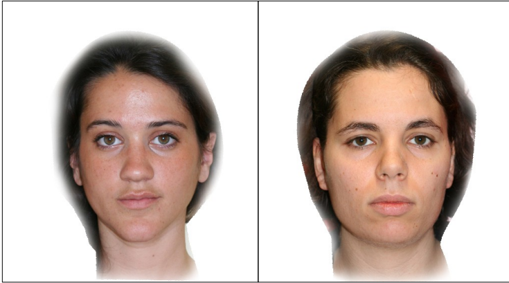
447 Figure 1. Example of a pair of faces used during evaluation of women's facial attractiveness by male 448 raters. For each pair of women, the rater was instructed to click on the photograph of the woman that he 449 found the most attractive. Photographs reproduced with permission.