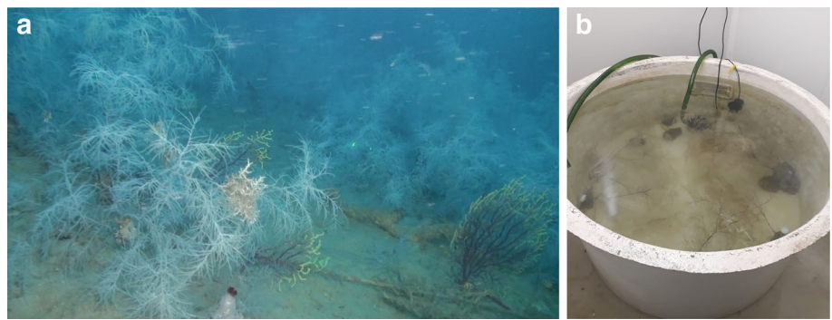
Fig. 1 A forest of Antipathella subpinnata at the sampling site (Bordighera, 63 m depth) (a), the experimental tank (2000 L) at the Biodiversarium facilities, with visible colonies (b)