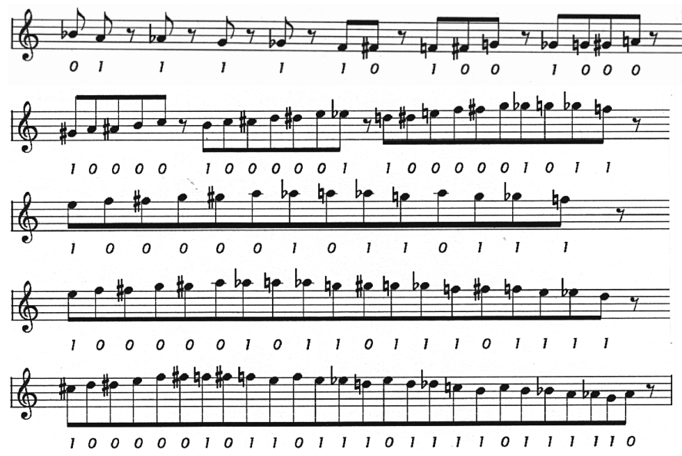
Figure 1: Melodic transcriptions of the Thue-Morse sequence and a delayed Thue-Morse sequence, where 1 is coded as a descending semi-tone, and 0 as a rising semi-tone. The first example follows the fifth iteration for the Thue-Morse sequence, with 2^5 notes and no delay. The balance of ones and zeros is always almost equal, and the melody never goes beyond a range of three notes. The second example follows the 16th iteration ( n = 16 ) with a delay of three time periods, i.e., with the formula: S_n = S_{n-1} + the inversion of S_{n-4} . The melody falls a bit, then rises more, as each 1 waits to be transformed into 10 and each 0 waits to be transformed into 01. In both transcriptions, pauses separate the sequences that were added at each transformation.