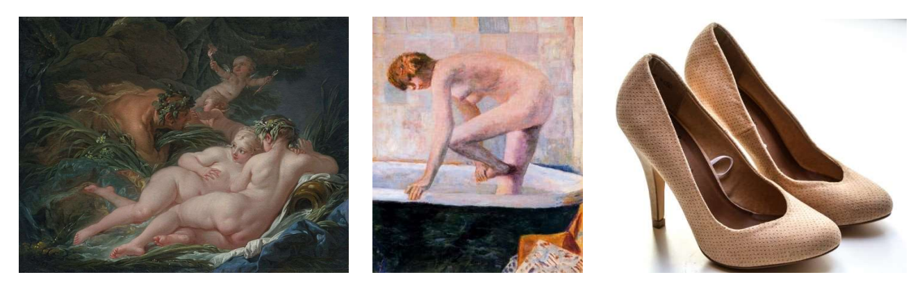
Fig. 4 - Boucher F. (1759) Pan et Syringe [oil on canvas]. Fig. 5 - Bonnard P. (c.1924) Pink Nude in the Bathtub [oil on wood panel]. Fig. 6 - A pair of nude shoes. Creative Commons Zero.

There is therefore a biological reason for the multiple visual representations of white skin in pink shades in Western artistic and cultural productions: in painting (Fig. 4; Fig. 5), but also in sculpture ( e.g. Three Horizontals (1998) by Louise Bourgeois), cartoons and comics (think of the pink face of Disney's Cinderella). Fashion and cosmetics also designate by "flesh" a set of products with colors supposed to refer to the color of the (white) skin (Fig. 6). More recently, it has been replaced by the term "nude", more specifically for make-up, evoking an idea of "natural", that is to say without artifice. In litterature, pink is used to describe white skin too, as in the poem "À une robe rose" of Théophile Gautier associating the pink fabric of a dress with the "light pink" color of a woman's skin (1850). From a lexicological point of view, the flesh color is also considered as a shade of pink, after the carnation of Whites (Mollard-Desfour, 2002, p. 152-153), but which is not to be confused with the generic term "pink" (Kerttula, 2002, p. 240; Kuriki et al. , 2017; Zimmermann et al. , 2015).