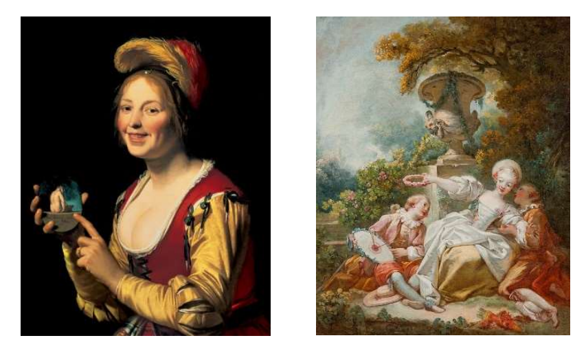
Fig. 9 - Honthorst (van), G. (1625) Smiling girl, a courtesan, holding an obscene image [oil on canvas]. Fig. 10 - Fragonard J.-H. (c.1755) La coquette fixée [oil on canvas].

As a shade of pink, there is no doubt that the flesh color refers only to the white Caucasian skins. However, the existence and recurrent use of a single term to designate the complexion, which is a white complexion, leads me to question pink flesh in articulation with the concept of race. Skin color has indeed always participated in the construction of individual and collective identities, and is done in the system of classification of individuals according to their skin color (Blanchard, Boëtsch & Chevé, 2008, p. 8-10). Mechthild Fend also specifies that it is no coincidence that the term "skin color" appeared in the second half of the 18<sup>th</sup> century in the theory of French art, simultaneously with racial anthropology, both discourses granting the superiority of white skin as the universal ideal and standard of beauty (2005). White skin has indeed been associated since Antiquity with beauty — especially female one (Pelletier-Michaud, 2016, p. 198), and youthness (Garo, 2008, p. 31), always considered an ideal of beauty to be attained in Japan (Wagatsuma, 1967), but also in black African communities (Emeriau, 2009). The blushing skin of embarrassed White women has also become a means for painters to bring eroticism to their canvas, also linking whiteness to desire and sexuality (Fig. 9; Fig. 10).