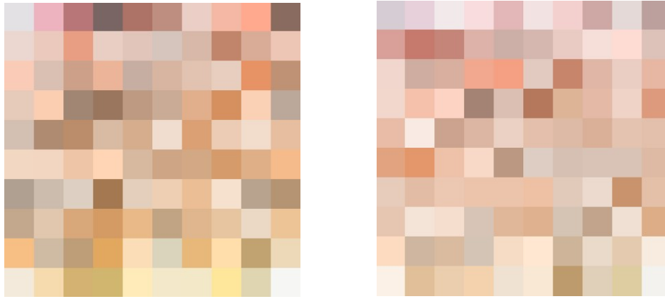
Fig. 7 and 8 - Color chart of flesh and nude colors, obtained from the collection of hundred pictures answering the keywords “flesh color” and “nude color” on the internet. January 2020.