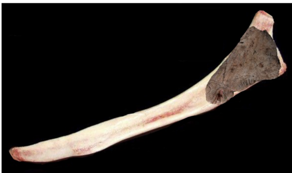
Fig. 1 Location of a “contour découpé” from the Cave of Enlène on a horse stylohyoid bone

Finally, it is noteworthy that in the remains attributed to the Middle Magdalenian, references to the animal have been made both in the context of an iconic relationship (a representation that looks like a real or potentially real animal) and in the context of an