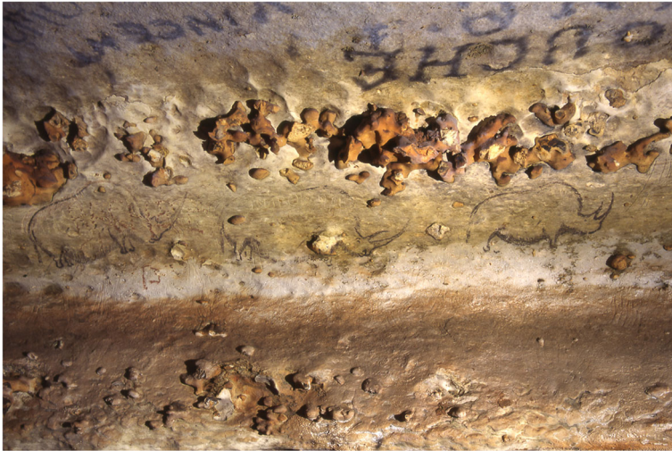
Fig. 4 In the Cave of Rouffignac, a frieze shows three woolly rhinoceroses, each of which can be distinguished by certain figurative attributes

than first trying to present the species itself through a stereotypical symbolic framework onto which they could then graft varying degrees of detail following a preestablished mental process. There does not seem to be any systematization in the representation of mammoths, even though they are all identifiable as such. It was thus perhaps a case not only of presenting mammoths but also of conveying the variety of different mammoths involved.