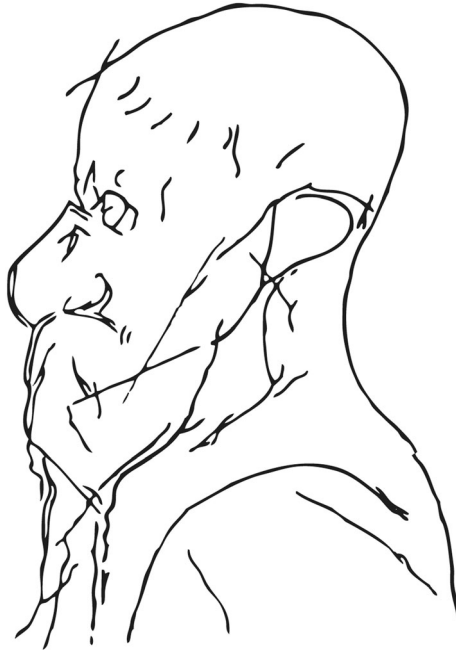
Fig. 5 An individualized human engraved, from the Cave of La Marche (Pales and Tassin de Saint-Péreuse 1976; Relevé L. Pales)