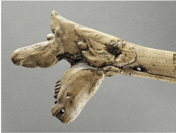
Fig. 2 Fragment of a spear thrower from the Cave of Mas-d'Azil. A skinned horse's head is carved in bas-relief (MAN 47080, © RMN-Grand Palais, MAN/Martine Beck-Coppola)

indexical relationship (an element that actually comes from an animal), according to the terms defined by Peirce (Peirce 1960, first ed.1903). These references have in many cases been combined—by seemingly intentional arrangement (voluntary spatial proximity) or on the same object (certain depictions of animals on bone material). Animal bones and representations thus sometimes appear to have been equivalent signs for Middle Magdalenian populations. As such, the classic approach in Palaeolithic archaeology, which systematically separates bones and representations, creates a division in what appears to have been a continuity. This systematic division is probably derived from our modern system of thought and institutions, which often postulate the existence of a universal distinction between an economic and nutritional sphere on the one hand and a symbolic sphere on the other (Birouste 2018). This assumption is not, however, consistent with that which is observed in the Middle Magdalenian and could hence