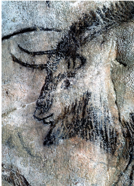
Fig. 8 A bison in the Cave of Niaux.

In the decorated caves, the visitor’s body is subject to a very specific context, which sometimes puts it in a singular relationship with an animal figure. Thus, it is at times necessary to slip alone through a narrow crevice to come face to face with an isolated figure (examples of this can be found at Niaux, Las Monedas, Le Tuc d’Audoubert, Rouffignac, Bédeilhac, Font-de-Gaume, etc. ). This leads to an encounter foreseen between two individuals: an individual animal figure and a single