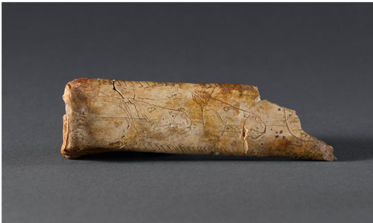
Fig. 3 “Contours découpés” depicted on the right metatarsal of a reindeer, from the Cave of Mas-d'Azil (MAN 47076)

indexical relationship (an element that actually comes from an animal), according to the terms defined by Peirce (Peirce 1960, first ed.1903). These references have in many cases been combined—by seemingly intentional arrangement (voluntary spatial proximity) or on the same object (certain depictions of animals on bone material). Animal bones and representations thus sometimes appear to have been equivalent signs for Middle Magdalenian populations. As such, the classic approach in Palaeolithic archaeology, which systematically separates bones and representations, creates a division in what appears to have been a continuity. This systematic division is probably derived from our modern system of thought and institutions, which often postulate the existence of a universal distinction between an economic and nutritional sphere on the one hand and a symbolic sphere on the other (Birouste 2018). This assumption is not, however, consistent with that which is observed in the Middle Magdalenian and could hence