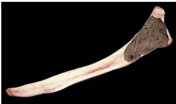
Fig. 1 Location of a “contour découpé” from the Cave of Enlène on a horse stylohyoid bone

Finally, it is noteworthy that in the remains attributed to the Middle Magdalenian, references to the animal have been made both in the context of an iconic relationship (a representation that looks like a real or potentially real animal) and in the context of an