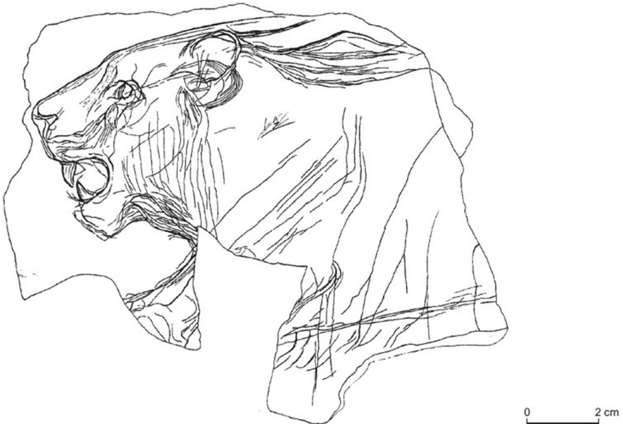
Fig. 6 An individualized lion engraved, from the Cave of La Marche (Pales and Tassin de Saint-Péreuse 1989; Relevé L. Pales)