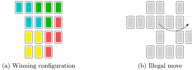
Figure 1: Examples of game configuration

Colored cards and actions. There are 4 types of card, red, yellow, green and blue cards, and 4 cards for each color. This gives us a total amount of 16 cards. The cards are placed face down in a grid of size 4x4 in a random way, so that the players cannot see their colors. The goal of the game is to gather together the cards of the same color. Figure 1a illustrates a winning configuration of the game.