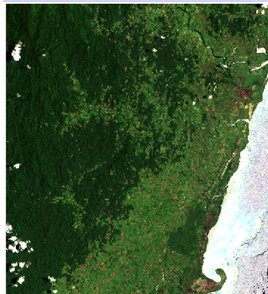
Sentinel 2 image