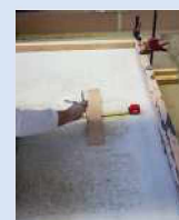
Lost volume measurement of the concrete slab