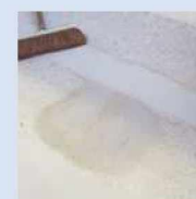
Heavy gravels pile scrubbed on the concrete slab