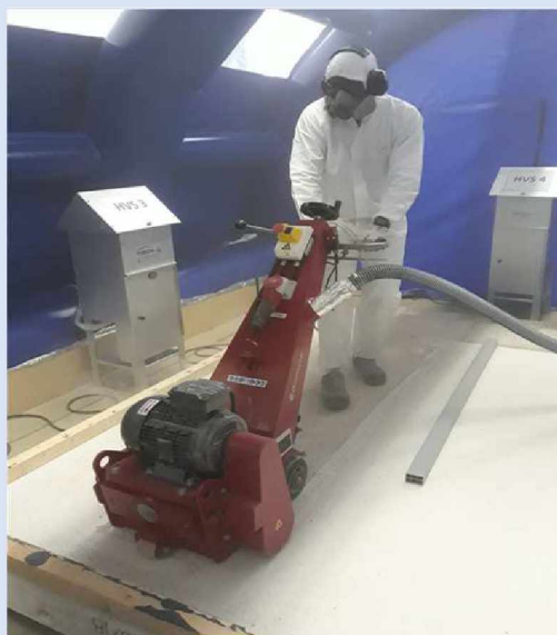
Aerosol collected on a TSP- HVS HEPA filter

The emitted aerosol during concrete scarifying was collected by five high-volume samplers (HVS-TSP) working each at 1.13 m 3 /min flowrate with HEPA (High Efficiency Particulate Air) filters.