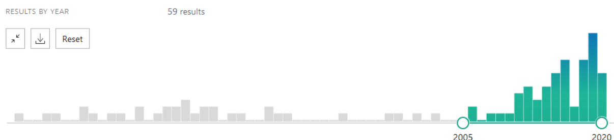
Figure 1 – Yearly visualization of works found on PubMed. In grey, we can see all available publications (1957-2020) and, in turquoise, our included sample (2005-2020). The number of publications by decade is: 1950s – 1; 1960s – 7; 1970s – 15; 1980s – 6; 1990s – 3; 2000s – 6; 2010s – 48; 2020s – 7.

Results of our request on PubMed highlight that, while, during several decades, students' mental health topic was often neglected, the number of publications has considerably raised over the last 15 years (2006-2020) (Figure 1).