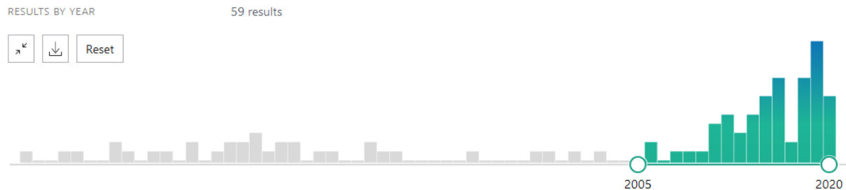
Figure 1 – Yearly visualization of works found on PubMed. In grey, we can see all available publications (1957-2020) and, in turquoise, our included sample (2005-2020). The number of publications by decade is: 1950s – 1; 1960s – 7; 1970s – 15; 1980s – 6; 1990s – 3; 2000s – 6; 2010s – 48; 2020s – 7.

Results of our request on PubMed (93 articles) highlight that, while, during several decades, students' mental health topic was often neglected, the number of publications has considerably raised over the last 15 years (2006-2020) (Figure 1).