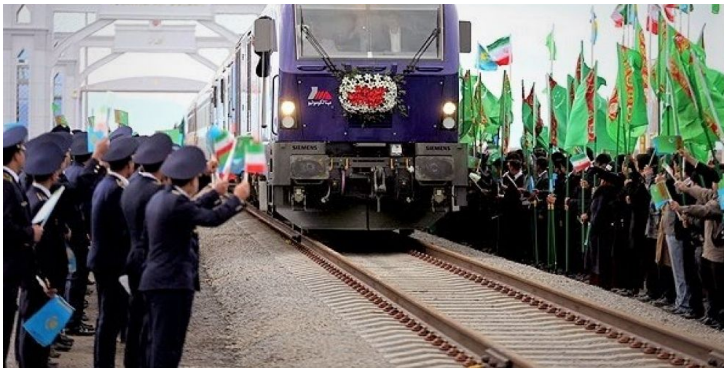
Iranian train rolls into Gyzyletrek, Turkmenistan, to inaugurate the Kazakhstan-Turkmenistan-Iran railway link, 2014: The eastern route is one of the most successful of the links between Russia and India in the INSTC network

When the Soviet Union collapsed in 1991, ending the Cold War, India not only lost its most reliable supplier of weapons, it also lost its most important partner in countering China because of the subsequent normalization of relations between Beijing and Moscow. But as Russia, the USSR's successor state, descended into economic chaos in the 1990s, India continued to import Russian weapons and looked to re-establish its special relations with Moscow. After Vladimir Putin came to power on the last day of 1999, Moscow achieved a measure of political and economic stability and began to look for strategic partnerships beyond the now-independent former Soviet republics.