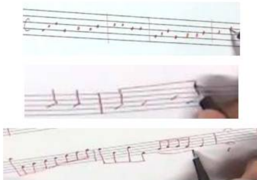
Figure 4. Handwriting behaviour of three experienced musicians: (top, a) note-heads prior to addition of beams (Participant 11, saxophone player); (middle, b) adding beam using inverted U-shape gesture (Participant 09, multi-instrumentalist); (bottom, c) adding slur, having written note-heads, stems, and beams (Participant 01, saxophone and guitar player).

Note-heads, stems, beams. There was no significant association between group membership and the direction in which participants wrote stems (upwards or downwards, p = .20 ). None of the participants wrote all the stems upwards; 12 wrote them downwards and nine wrote them in both directions. Direction of writing is likely to be affected, however, by the position of the stem in relation to the note-head and whether it is isolated or one of a group of notes. Indeed, 12 participants joined the first and last notes of a group without lifting the pen from the paper, in one or more cases, using a U- or inverted U-shaped gesture, as shown in Figures 4b and 5c.