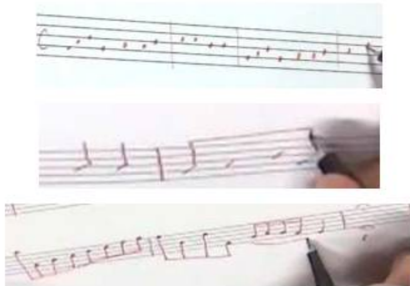
Figure 4. Handwriting behaviour of three experienced musicians: (top, a) note-heads prior to addition of beams (Participant 11, saxophone player); (middle, b) adding beam using inverted U-shape gesture (Participant 09, multi-instrumentalist); (bottom, c) adding slur, having written note-heads, stems, and beams (Participant 01, saxophone and guitar player).

Note-heads, stems, beams. There was no significant association between group membership and the direction in which participants wrote stems (upwards or downwards, p = .20 ). None of the participants wrote all the stems upwards; 12 wrote them downwards and nine wrote them in both directions. Direction of writing is likely to be affected, however, by the position of the stem in relation to the note-head and whether it is isolated or one of a group of notes. Indeed, 12 participants joined the first and last notes of a group without lifting the pen from the paper, in one or more cases, using a U- or inverted U-shaped gesture, as shown in Figures 4b and 5c.