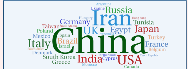
Figure 2: Countries of origin of n=300 Gene papers with nucleotide sequence errors and/or problematic cell lines. Word cloud created using https://wordart.com/