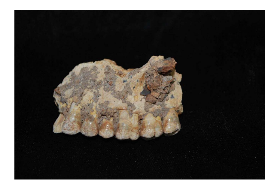
Fig. 1. The Misliya-1 specimen from a lateral view. The crust under the zygomatic arch was analyzed for U-Th dating. Note the different layers of the crust and the embedded foreign elements (bones and flints) suggesting different depositional episodes.