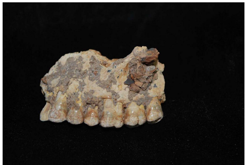
Fig. 1. The Misliya-1 specimen from a lateral view. The crust under the zygomatic arch was analyzed for U-Th dating. Note the different layers of the crust and the embedded foreign elements (bones and flints) suggesting different depositional episodes.

3) Direct dating of Misliya-1 provided a U-series age of 70.2 \pm 1.6 ka and a combined U-series and electron spin resonance (US-ESR) age of 174 \pm 20 ka. Because uranium uptake may be delayed after the death of the organism, and because it is difficult to accurately evaluate the radiation effects from previous computed tomography (CT) scanning, these two ages should be regarded as the minimum and maximum age brackets for the fossil, respectively. Misliya-1 was CT-scanned three times prior to the ESR dating analysis (1). The x-ray dose during CT scanning is highly variable (6–8). On the basis of our recent study (7), we could roughly estimate that the total x-ray dose was approximately 30 Gy, resulting in an effective equivalent dose ( D_E ) value of 98.3 \pm 5.3 Gy. The corresponding US-ESR age would thus be 152 \pm 24 ka (i.e., agreeing within error with the TL results). However, considering the significant uncertainty in the true