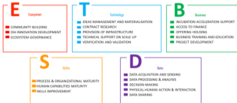
Fig. 2. Types of services in the ETBSD reference model

Each one of the five classes considered in the proposed ETBSD reference model can be declined in several types of services, as shown in the figure 2 below. The types of services represent the main categories of services provided by the DIH to its stakeholders in each of the five specific macro-classes .