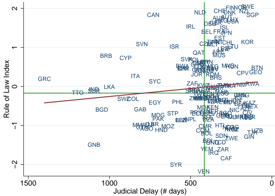
(b) Rule of Law and Judicial Delay

Figure 1: Judicial Delay-Quality Correlation. Green vertical and horizontal lines represent the median value in Judicial Delay and the Judicial Quality variables. The red lines represent a linear fit of an OLS regression of the Judicial Quality variable on Judicial Delay. The Judicial Delay variable is extracted from the World Bank's Doing Business Enforcing Contract's "time" metric and measures the average number of days to conclude a lawsuit in a country. The Judicial Quality Index in Figure 1a is provided by the World Bank's Doing Business program. The Rule of Law Index in Figure 1b is provided by the World Bank's Worldwide Governance Indicators project.