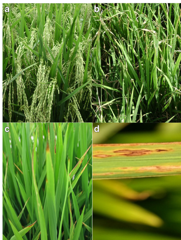
Fig. 1 Boron nutrition in rice. a Adequate boron. b, c Boron deficiency (interveinal chlorosis and necrotic spots). d Boron toxicity

Boron is vital for essential plant functions as it is an integral component of rhamnogalacturonan II (RG-II) which acts as a binding fraction in cell walls and, therefore, supports membrane integrity, cell wall synthesis, and the indole acetic acid