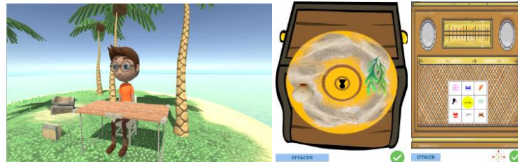
Fig. 3. Animations Proposed

open source programs Blender and Animaker. Fig 3 shows some of the screens which are part of the animations.