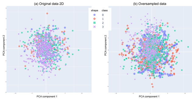
Figure 3: Principal Component Analysis 2D scatter plot visualization. (a) Original data. (b) Data oversampled with technique ADASYN [11].

As we discussed in Section 3, the data is heavily skewed to cases with higher severity. The impact of this imbalance is that the ML algorithms are not able to correctly learn which regions of the space refer to which classes. As we can see in Figure 3(a), although the samples of class 3 (severe) patients are concentrated in a specific central region, there are samples of class 3 scattered all over. Many samples of class 3 can be considered as outliers (located away from the denser cluster) that occupy odd regions of the space, yet, they outnumber other classes due to the strong imbalance. As a result, during our initial experiments, our algorithms reported that all the test samples belonged to class 3.