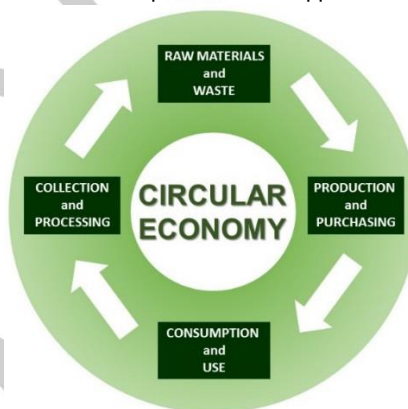
Figure 1. Representative scheme of circular economy.

economy emphasizes, among other aspects, waste utilization as a way to close the cycle and minimize the use of resources (Figure 1). When a product reaches the end of its function, reuse and recycling provides an opportunity to prolong the usefulness of its constituent parts even further. Meanwhile the inherent value of the material embodied in the product is extended rather than wasted. One of the major challenge of this strategy, for example for waste, is about the need to convert low economic value waste into high value products and by developing a process globally less expensive than the corresponding virgin fossil resource. It is undoubtedly in this kind of strategy that the chemist will be able to contribute to the development of new approaches.