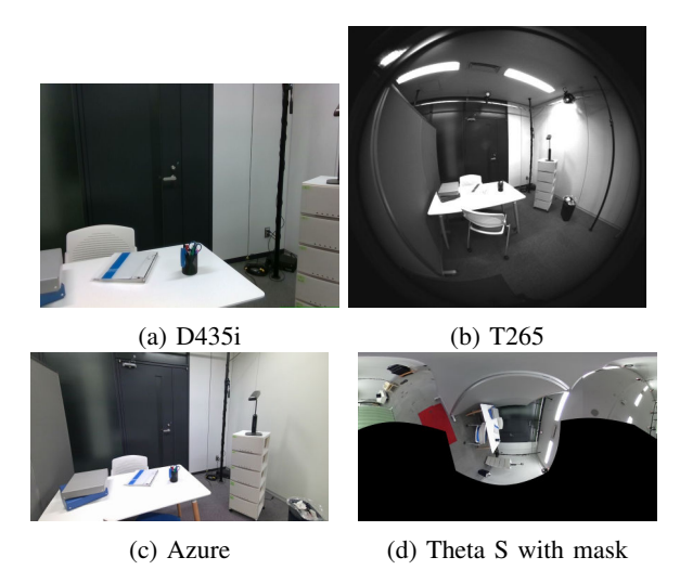
Fig. 6: Cameras field of view at pose D