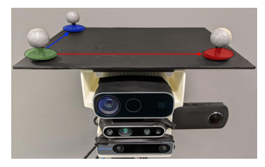
Fig. 1: 3D printed support holding cameras and markers used by the motion capture system

The absolute pose error (APE) evaluates the global consistency of the estimated trajectory by comparing the absolute error between the estimated and groundtruth poses over a trajectory. As previously mentioned, the reference frame for different trajectories may be different. We must align them before comparison. This alignment is done by least-squares