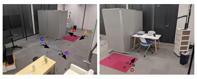
Fig. 4: Environment within the motion capture system with poses A, B, C, D and paths illustrated. Each black arrow is the looking direction of the camera for each pose.

Whereas dense vSLAM algorithms produce maps which are often visually checked by looking at ghost walls or duplicates of the same actual environment, sparse maps of featured-based vSLAM, as OpenVSLAM, makes difficult a similar analysis. Hence, to quantify its quality we use the RMSE<sub>trans</sub> of APE between the groundtruth and the estimated trajectory at the localization only stage.