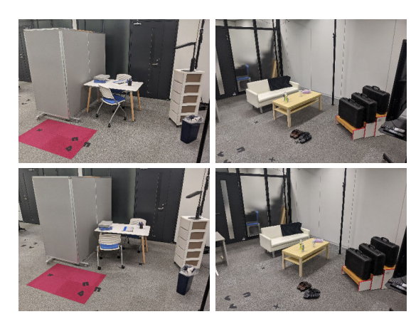
Fig. 5: Two areas prior and after scenery modifications (chair, bucket, tables, tables objects, slippers, sofa).

sequences; we have MapA (18.59, 162), MapB (26.94, 93) and MapC (17.52, 120).