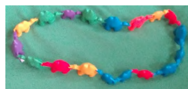
Figure 2. Mario's big crown / tracks / escalator

Miss, I'm going to make a crown ( he makes two rings of camels, then wears one on his head ). He then takes it off, opens out both crowns). Sarah, now I'll make a big one, so we'll have a big crown for us. ( He makes a circuit of 18 camels – see Figure 3 ). Wow, a big crown! It's a bit [like] tracks ... like, like a[n] escalator. Escalator! Escalator!