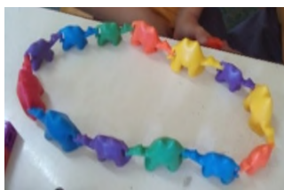
Figure 1. Connecting camels

The 25-minute sessions were video-recorded to allow for later transcription. Analysis was done by first viewing the videos and noting the children’s conversations as they played without my intervention, and then noting the development of the conversation and actions when I did interact with them. I kept Sfard’s (2008) discourse characteristics in mind in order to select excerpts for discussion. My main a priori interest was counting but, as a result of the direction of the play, I was also able to link counting with