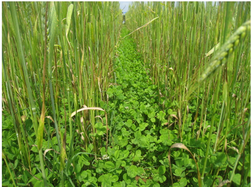
Fig. 2 Intercropping of organic wheat and white clover in southeastern France

roughage, fresh or dried fodder, or silage. Agroecology gives priority to feed (e.g. fresh grass, hay, silage) compared to food (e.g. cereal, pulses).