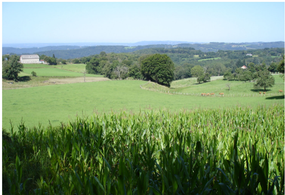
Fig. 1 Connecting livestock production, cropping and forestry with an agroecological approach, western France

Currently, agroecological farming is not market-driven: no certification systems nor labels exist so far for the produce, it