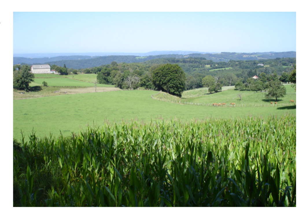
Fig. 1 Connecting livestock production, cropping and forestry with an agroecological approach, western France

Currently, agroecological farming is not market-driven: no certification systems nor labels exist so far for the produce, it