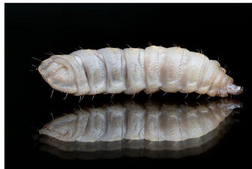
Fig. 2 Larva of the black soldier fly ( Hermetia illuscens ).

The demand for meat products is expected to increase from current levels by more than 75% in 2050 due to population growth and rising incomes. The per capita increase will be larger in developing countries (from 28 kg in 2005/2007 to 42 kg in 2050) than in developed countries (from 80 to 91 kg) (Herrero et al. 2015). Moreover, the relative increase in volume is more pronounced in developing countries (113%) than in developed countries (27%) (Alexandratos and Bruinsma