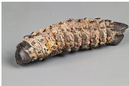
Fig. 1 Mopane caterpillar ( Imbrasia belina )—sun dried.

Apart from being collected from nature, insects can also be reared in confined industrial facilities (Oonincx and de Boer 2012). Western countries are now investigating the potential of this approach, prompted by the need to find alternative protein sources. These alternatives are needed because demand for meat products is increasing while the available land area for livestock production is limited (Van Huis 2015). In addition, current livestock production contributes greatly to a number of environmental problems such as acidification due to leaching of ammonia, climate change due to greenhouse gas emissions, deforestation, soil erosion, desertification, loss of plant biodiversity, and water pollution. These are highlighted in Steinfeld et al. (2006) and later in other publications (Gerber et al. 2013; Herrero et al. 2015; Herrero et al. 2016). The question is whether the production of insects as an alternative protein source is environmentally more sustainable than the production of conventional animals (Abbasi et al. 2015, Gahukar 2016).